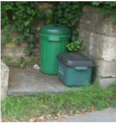
Bin and green box back in their place after collection - with lids on. Too much to ask?