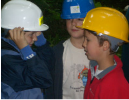
Three Midford lads getting kitted out ...