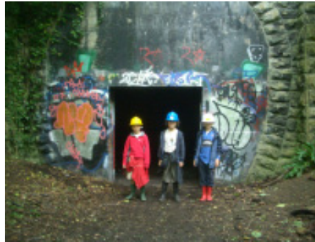
... and arriving safely at the other end

Visit www.twotunnels.org.uk for up-to-date information about this project