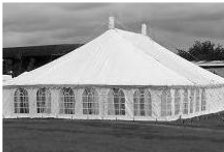
Residents fear return of the noisy marquee

Over a hundred letters of objection were received by the Council's Licensing Department when Combe Grove Manor Hotel applied for permission to serve alcohol to non-residents and to offer live entertainment into the early hours seven days per week.