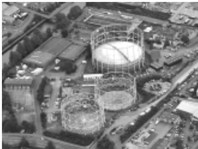
Western Riverside wasteland

After years of planning and consultation there's some tangible progress on Western Riverside. The large housing development received outline planning permission in January.