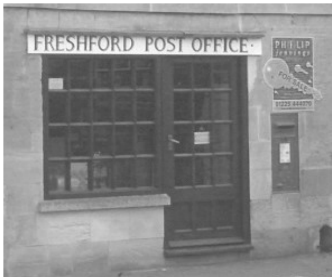
Freshford's shop and post office is under threat