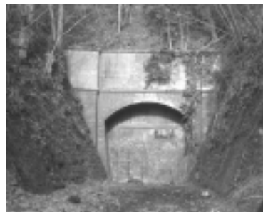
Cycling/walking through this tunnel?

www.twotunnels.org.uk tells you all about it!